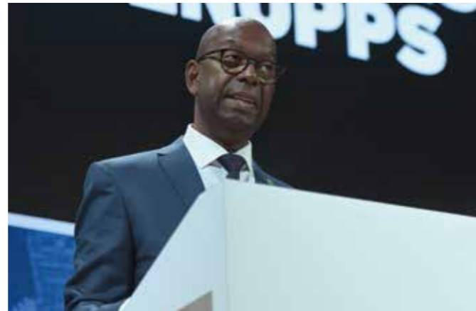
Bob Collymore, Safaricom CEO

Effective tax systems matter for the growth of modern and inclusive economies. Tax is a policy tool that governments use to achieve their objectives, such as stimulating job creation, capital investment in particular sectors or locations or encouraging environmental or social outcomes. What is most important for businesses is informed and fair policy making and regulation, an independent judiciary and respect for the rule of law. Uncertain or poorly designed tax rules are a barrier to investment. When this is compounded by poor understanding of the intention of a particular policy initiative or tax instrument, it can become major source of distrust between government, citizens and the private sector.