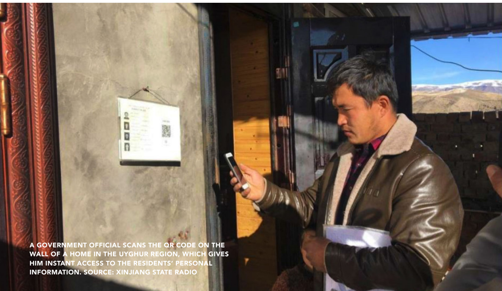
A GOVERNMENT OFFICIAL SCANS THE QR CODE ON THE WALL OF A HOME IN THE UYGHUR REGION, WHICH GIVES HIM INSTANT ACCESS TO THE RESIDENTS' PERSONAL INFORMATION.

The current COVID-19 crisis offers opportunities for businesses and investors to be part of shaping a new social contract not only to address the immediate economic hardship faced in particular by workers around the world, but also to build more sustainable and equitable business models in the future. Unfortunately, in the Uyghur Region and other parts of China, ethnic and religious minorities and those promoting human rights are at greater risk of contracting COVID-19 . Uyghurs and other Turkic and Muslim-majority peoples in the Uyghur Region have been forced to continue to work despite lockdowns and the Chinese government has been moving them to factories in parts of China with high infection rates. The close quarters of internment camps pose heightened risks for the rapid spread of disease among those detained. The Chinese government has detained and disappeared Chinese human rights defenders, doctors, lawyers, and journalists who have sought to highlight these risks and monitor government responses to COVID-19. In addition, the Chinese government, in violation of privacy rights, is using the pandemic as grounds to ramp up surveillance to track and restrict people's movement.