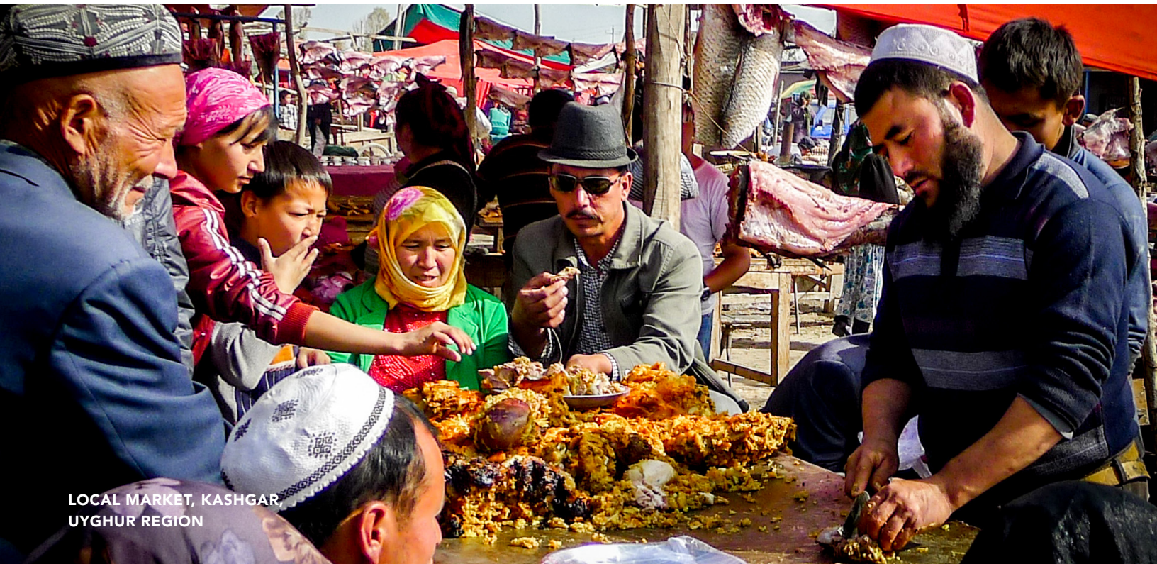
LOCAL MARKET, KASHGAR, UYGHUR REGION

The violation of one human right is often connected to the violation of other human rights under the Universal Declaration of Human Rights (UDHR) . For example, the sweeping surveillance of ethnic minorities is a violation of their right to privacy (UDHR Article 12). The personal information gathered is used to restrict the movement of minorities (a violation of UDHR Article 13) and in numerous instances extrajudicially detain them (a violation of UDHR Article 9). Detained Uyghurs and other Muslim-majority peoples are prohibited from exercising their right to freedom of religion (a violation of UDHR Article 18). Despite efforts by authorities to justify these systems of repression variably as, contingent on the context, counterterrorism or poverty alleviation measures, their real purpose appears to be to eradicate the cultural and religious practices of predominantly Turkic and Muslim-majority peoples. Please refer to Annex A to this Guidance, which provides a list of human rights under the UDHR that are being violated by government authorities, at times with the involvement of business enterprises.