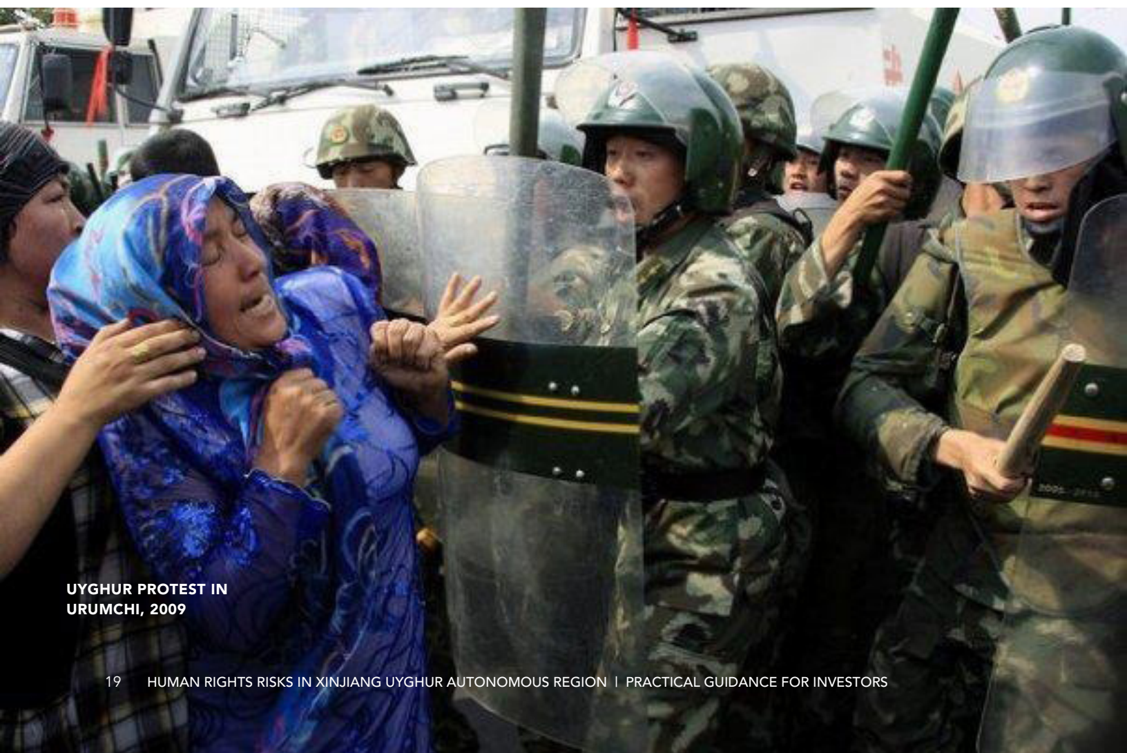
UYGHUR PROTEST IN URUMCHI, 2009

Storebrand Asset Management was one of many Norwegian financial institutions that divested shares in pipeline companies in the Dakota Access pipeline project. Storebrand divested $34.8 million worth of shares, after months of efforts to influence the pipeline route with no success, including engaging individually as well as collectively with a group of international investors with the pipeline companies. Storebrand also organized a letter signed by 100 investors expressing their concerns to the pipeline's creditors. It was only after all these efforts failed, that the investor decided to sell its shares .